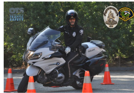
MOTORCYCLE TRAINING COURSE

The Pomona Police Department received grant funding for the California Office of Traffic Safety (OTS) to promote motorcycle safety awareness with free, hands-on rider trainings led by local law enforcement. The $24,000 grant will pay for a series of free motorcycle safety courses that allow riders to practice braking, turning, steering, entering traffic and other skills that help avoid crashes and improve rider safety on the road. The motorcycle training program will run through September 2024. The next free course is scheduled for July 20, 2024 at Veterans Park from 9:00 a.m. to 3:00 p.m. Please see flyer for registration details. Funding for this program is provided by a grant from the California Office of Traffic Safety, through the National Highway Traffic Safety Administration.