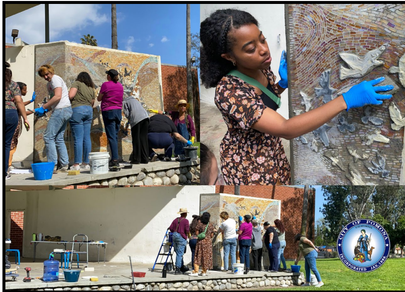
Photo Location: Ganesha Park (Bandstand), 1575 N. White Ave. Pomona, CA 91768

If you've seen some wonderful quotes on the sidewalks of our parks, it's thanks to the program that Souther California Service Corps is completing! This program works with youth to create several art projects throughout the City. Be on the look out for more!