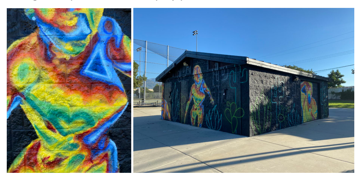
Here's a list of Artist you can catch at work and where!

We hope the Jaycee Park community enjoys this new addition!