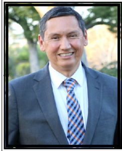
Mayor Tim Sandoval