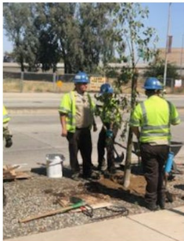
CCC North Plantings

This Grant was initiated in 2016 however, many delays, including various State-wide fires and the COVID-19 shutdowns, halted progress on the tree plantings. Even as the manpower was ready to begin planting in early spring 2022, fires requiring the services of the Conservation groups threatened to delay the progress once again. With the trees ordered and staged at the Pomona Yard without automatic watering resources, Staff decided to plant the trees, rather than wait until Fall.