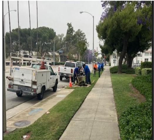
SGVCC South Plantings

With a crew from each Conservation group, and the City's Park Supervisor and Lead Maintenance staff, they worked for approximately six weeks to plant the 255 trees north of Mission Blvd. and 255 trees south of Mission Blvd. in various parkways and parks throughout the City. With planning and determination, the