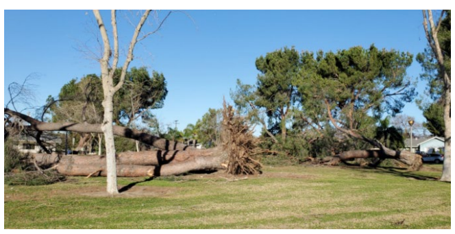
Willie White Park