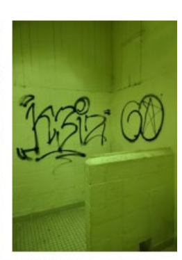
MLK Park - Graffiti