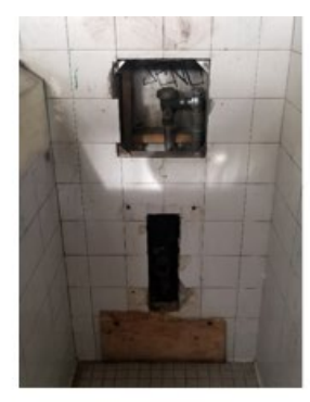
Palomares Park Stolen fixtures and covers