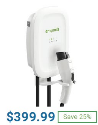
Level 2. Up to 48A. Hardwired or NEMA. 24' Cable. Indoor/Outdoor. Charges any EV