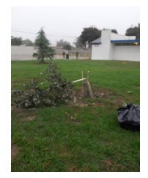
JFK Park New tree plantings vandalized

Please help reduce vandalism in our City Parks by reporting issues to the Pomona Police Department by calling Police Dispatch (909) 622-1241.